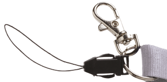
Mousqueton standard & attache téléphone Standard hook with mobile phone holder Mosquetón estándar y hebilla para teléfono móvil