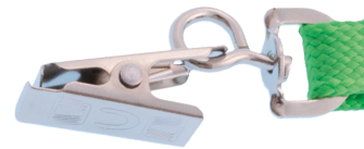
Pince croco Crocodile clip Pinza cocodrilo