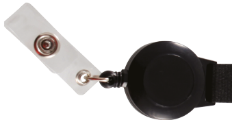
Zip intégré Badge reel Yoyo retractil